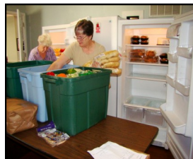
CAP volunteers fill empty shelves.

tinue to bring your non-perishables to all Elks Lodge meetings. Also, you may drop off items anytime Monday - Friday 8:30—5:00 at Conway Glass at 2416 Main Street.