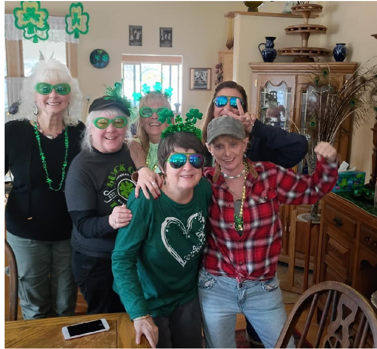
Do you think these gals had fun on St. Patrick's Day?

Please note this schedule is tentative and may be changed.