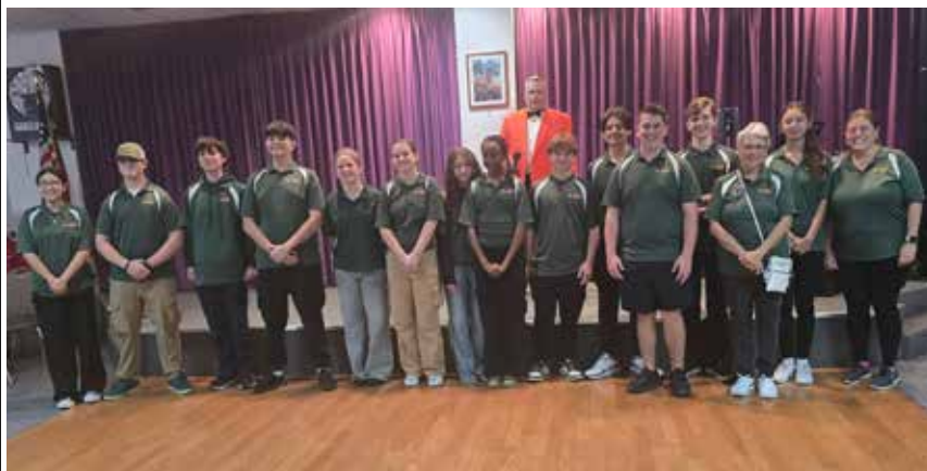
Seminole High School Band did a great job serving.