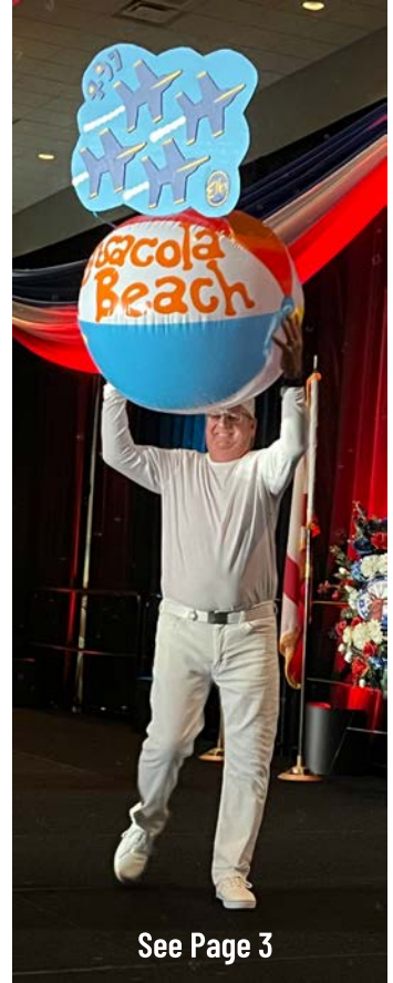
See Page 3