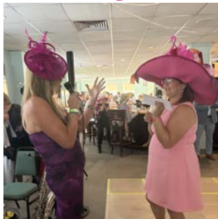
Ladies Derby Costume Winner