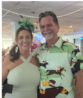
Derby Couples Winners