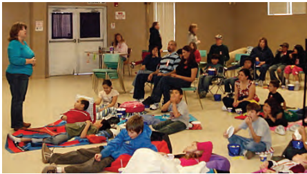
Participants enjoy Pinal Mountain, Ariz., Elks Lodge 2809 Youth Movie Night