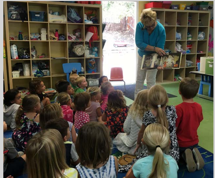
Atascadero, Calif, Lodge No. 2733