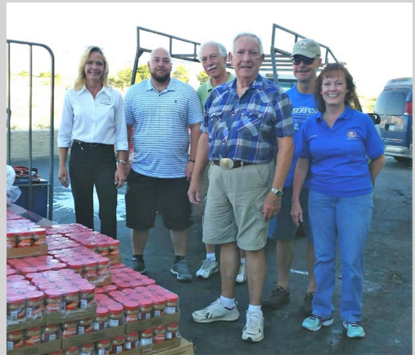
Kingman, Ariz., Lodge No. 468