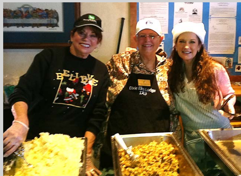
St. George 'Dixie', Utah, Lodge No. 1743