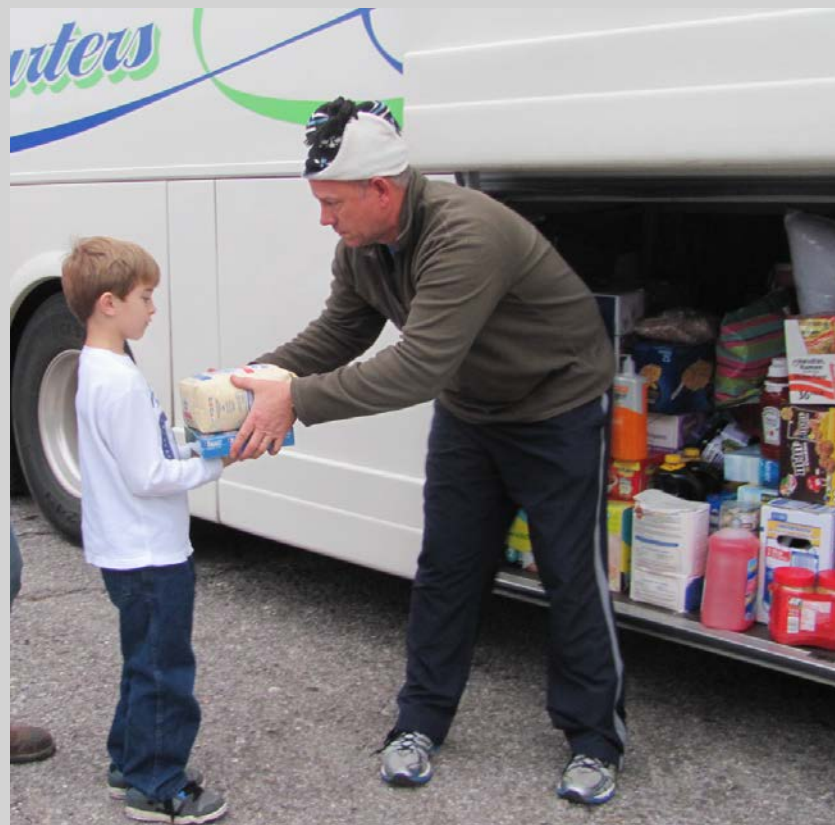
Wichita, Texas, Lodge No. 1105