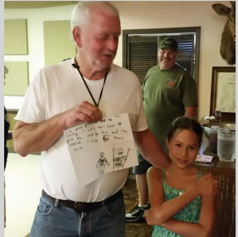
Statesville, N.C., Lodge No. 1823