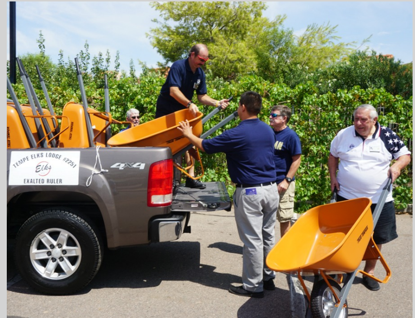
Tempe, Ariz., Lodge No. 2251