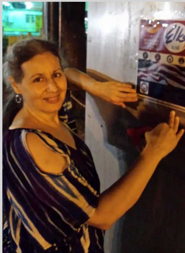
Brownsville, Texas, Lodge No. 2876