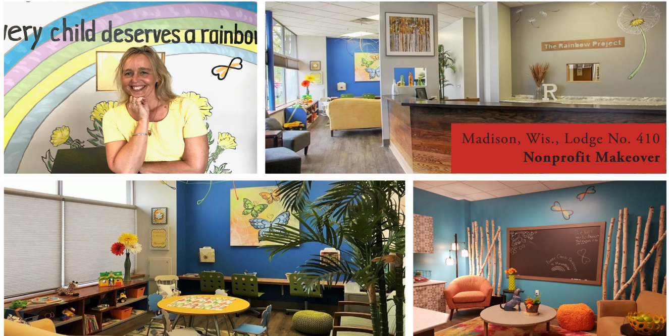
Madison, Wis., Lodge No. 410 Nonprofit Makeover

Promise Grants are $2,500 grants available to the first 500 Lodges that apply for an eligible charitable youth activity, in which Elks and youth have direct interaction. Lodges do not need to meet the GER's per-member-giving goal to apply. Here is an example of a real application.