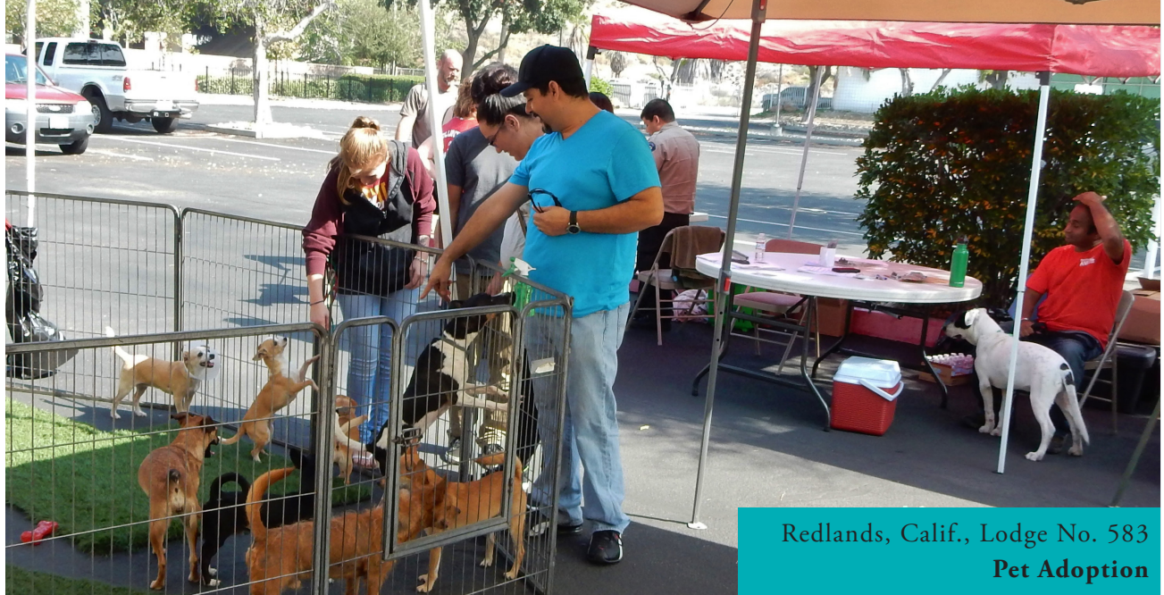
Redlands, Calif., Lodge No. 583 Pet Adoption

Beacon Grants offer Lodges the opportunity to develop a new, ongoing, Elks-led charitable project that the Lodge will be known for in the community. Lodges do not need to meet the GER's per-member-giving goal to apply. Here is an example of a real application.