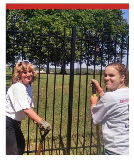
Townson, Md., Lodge No. 469 Members of the Lodge rolled up their sleeves to help with landscaping and renovation efforts at a local Boys and Girls Club.