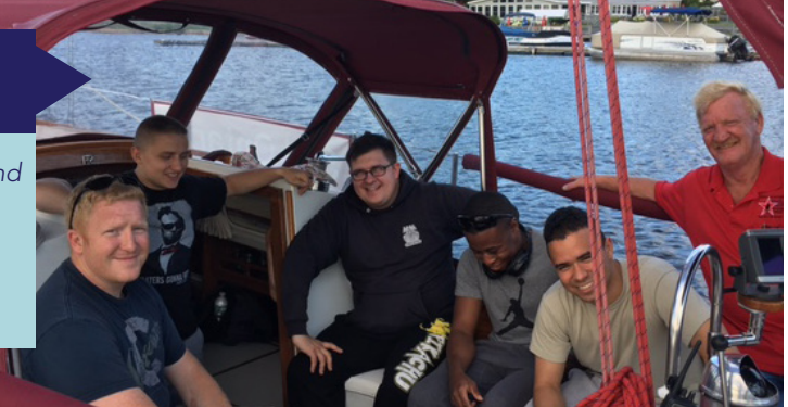
hosts sailing trips and picnics at the Fort Drum rehabilitation center for returning wounded warriors.

Freedom Grants: In 2016-17, 180 Lodges received Freedom Grants to serve local veterans and military members.