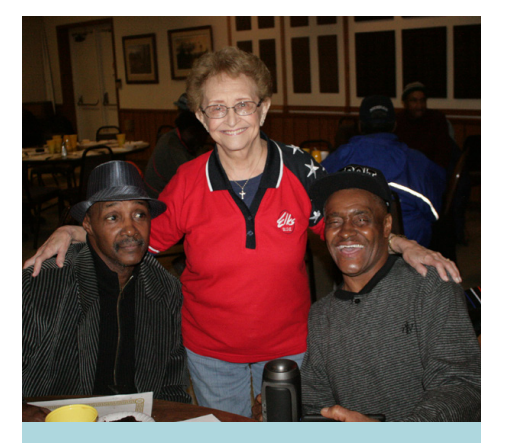
Our volunteers connect directly with veterans, providing individual attention and care.

Elks help veterans relax and enjoy community events.