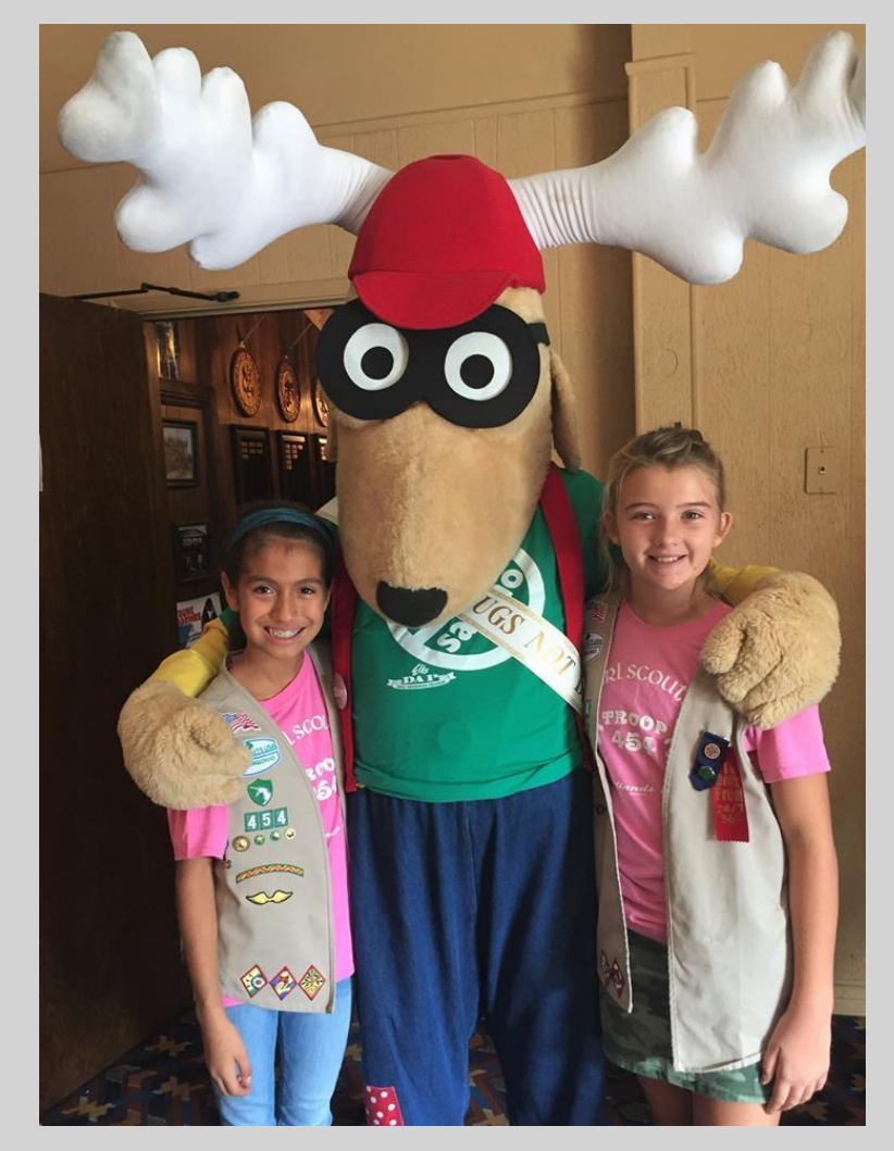
Redlands, Calif., Lodge No. 583 Beacon Grant project