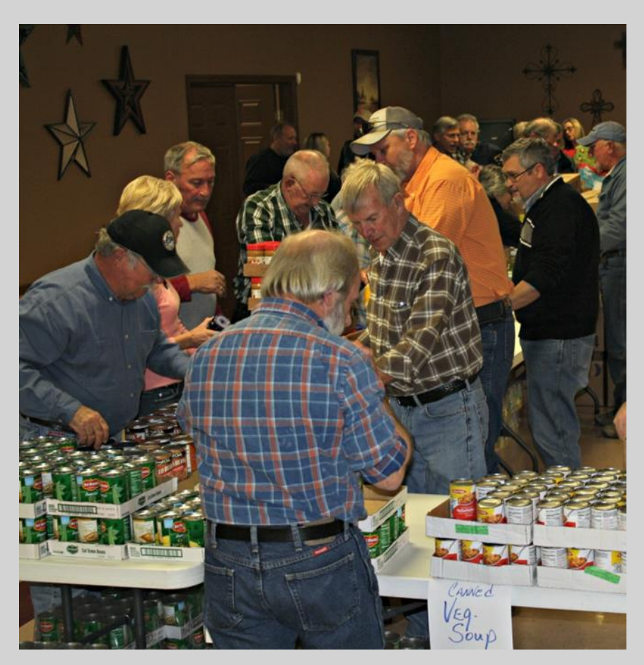
Fayetteville, Tenn., Lodge No. 1792 Beacon Grant project