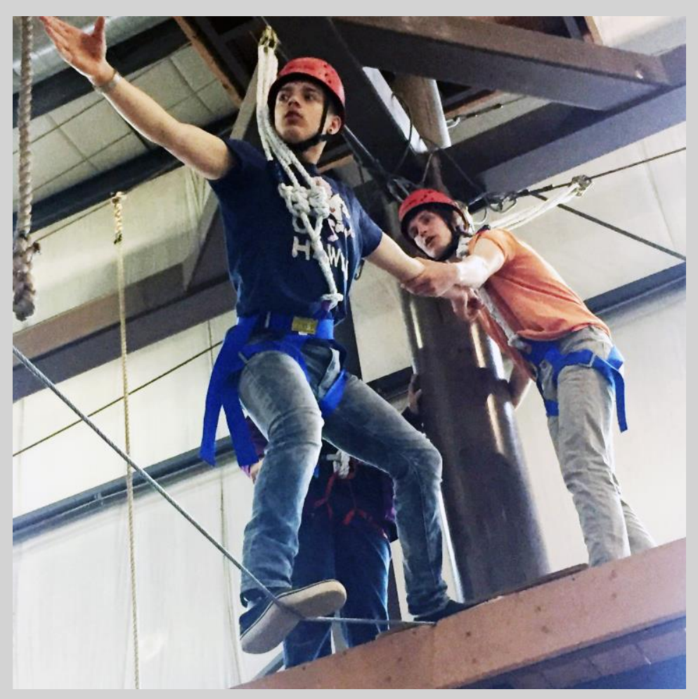
Tawas Area, Mich., Lodge No. 2525 Impact Grant project